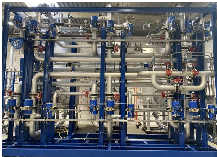
VF2 dryer TSA 2 200-2,5