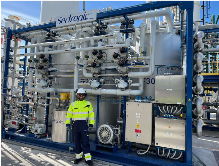
Hydrogen cryogenic purifier (3 columns) EF 1000-15