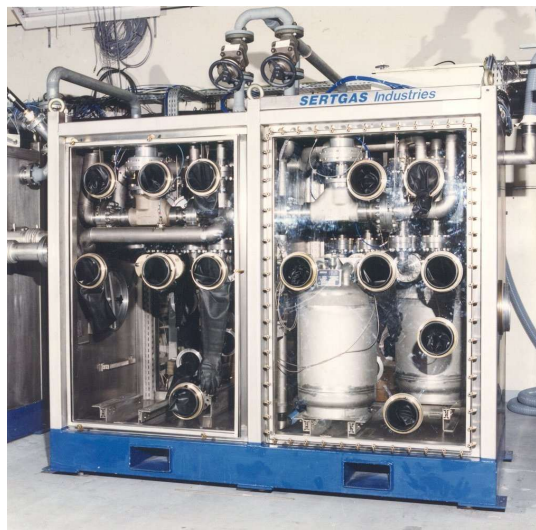
Tritium removal unit 250 Nm 3 /h – AP