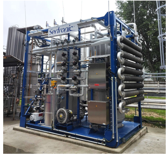
Hydrogen cryogenic purifier EF 1500-250