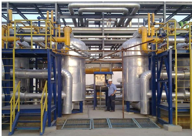
Nitrogen dryer TSA 34 000-10