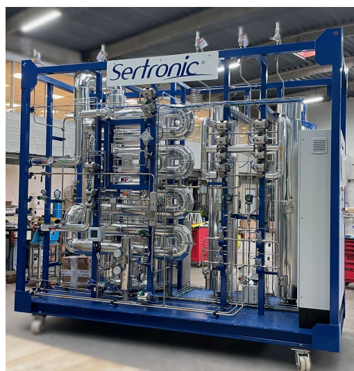
Hydrogen purification unit DS 2000-85