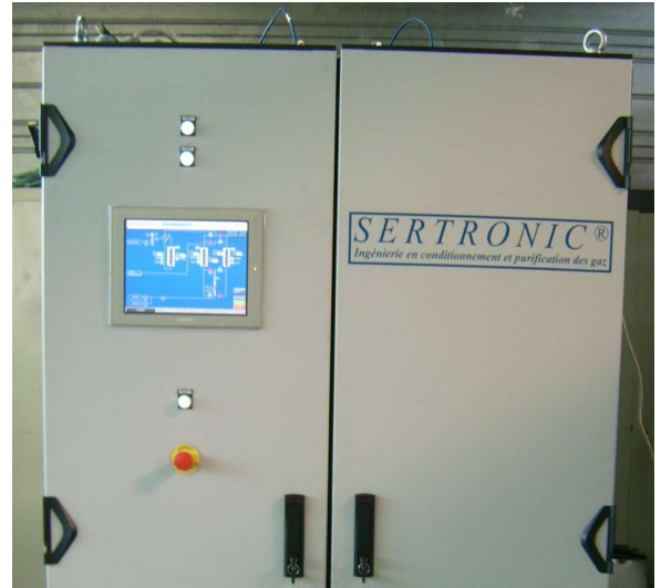
Oxygen purifier M 5 -10