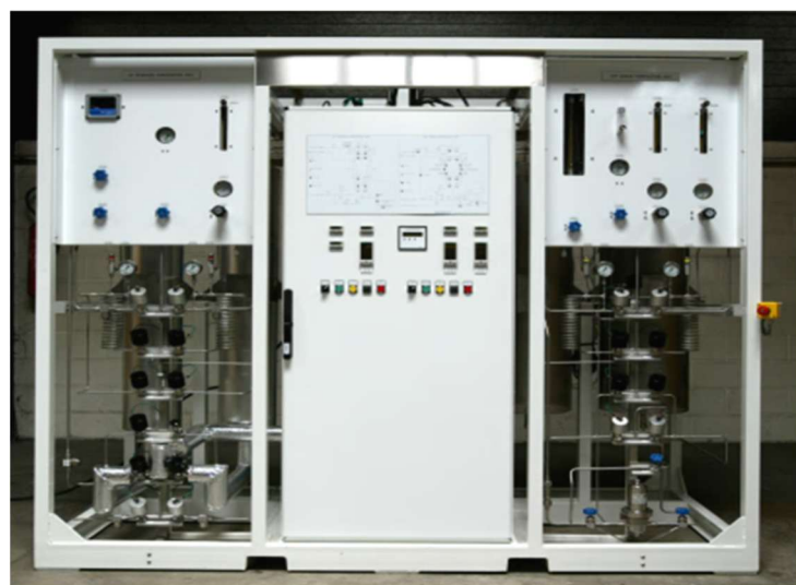
Filltronic® purifiers N 500-250