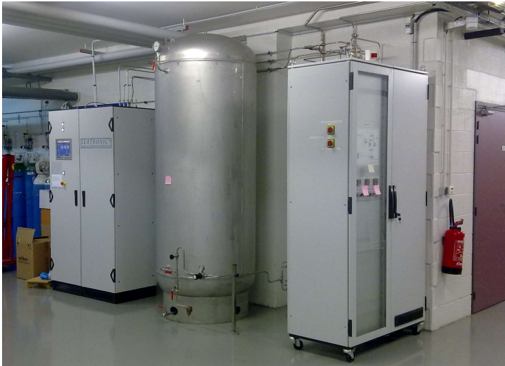
2 Air purifiers M 5-10